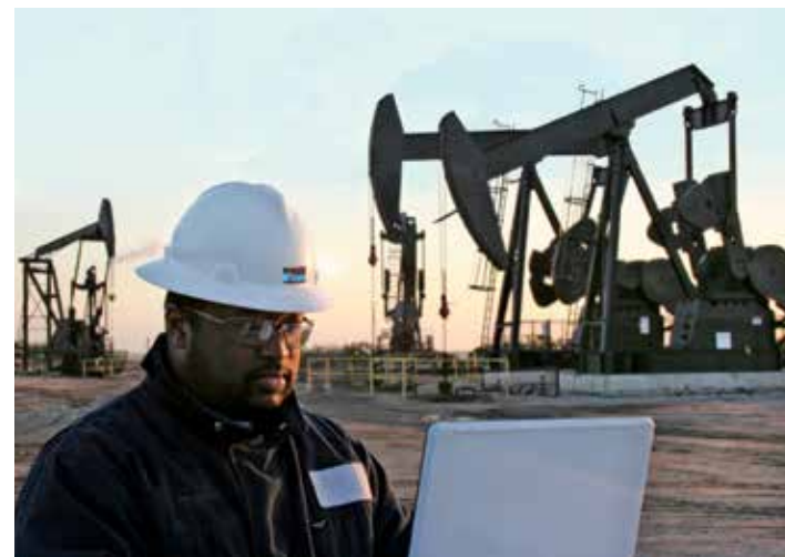
Production Operator, Inglewood Oil Field