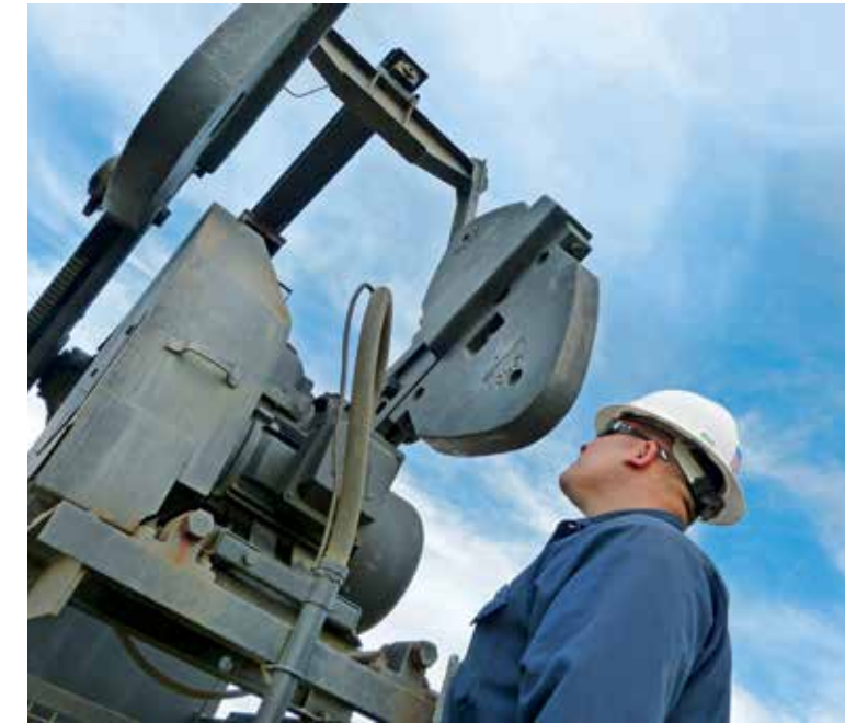
Production Operator, Inglewood Oil Field